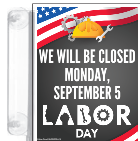
Vertical 8.5"W x 11"H Item #21

Please email us for shipping prices at gaildoyle@holidaysignsusa.com