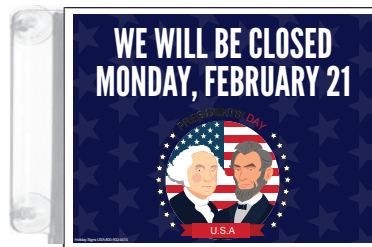
Horizontal 11"W x 8.5"H Item #20