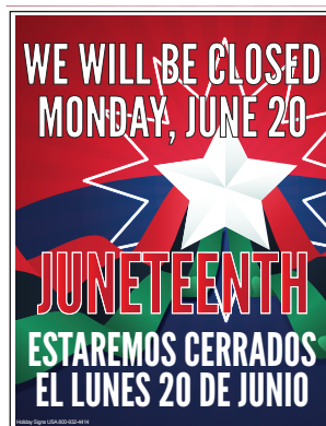
#5- Vertical - English/Spanish