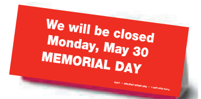
#6- Table Tent

*The Sign Samples Do Not Depict 2024 Year Holidays.